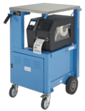
Powered Mobile Print Cart