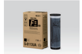
RISO INK FII Type Black (1000 ml)