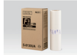
RISO MASTER FII Type (A3: 220 sheets)