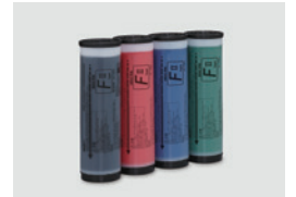
RISO INK FII Type Color (1000 ml)

The RISO i Quality mark indicates a RISO product compatible with the RISO i Quality System.