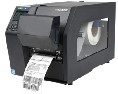
Barcode Verifier (T8000 ODV-2D)